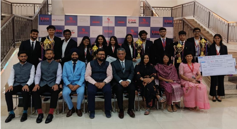
Winners of International Med-Arb Competition 2025 SLS, Nagpur