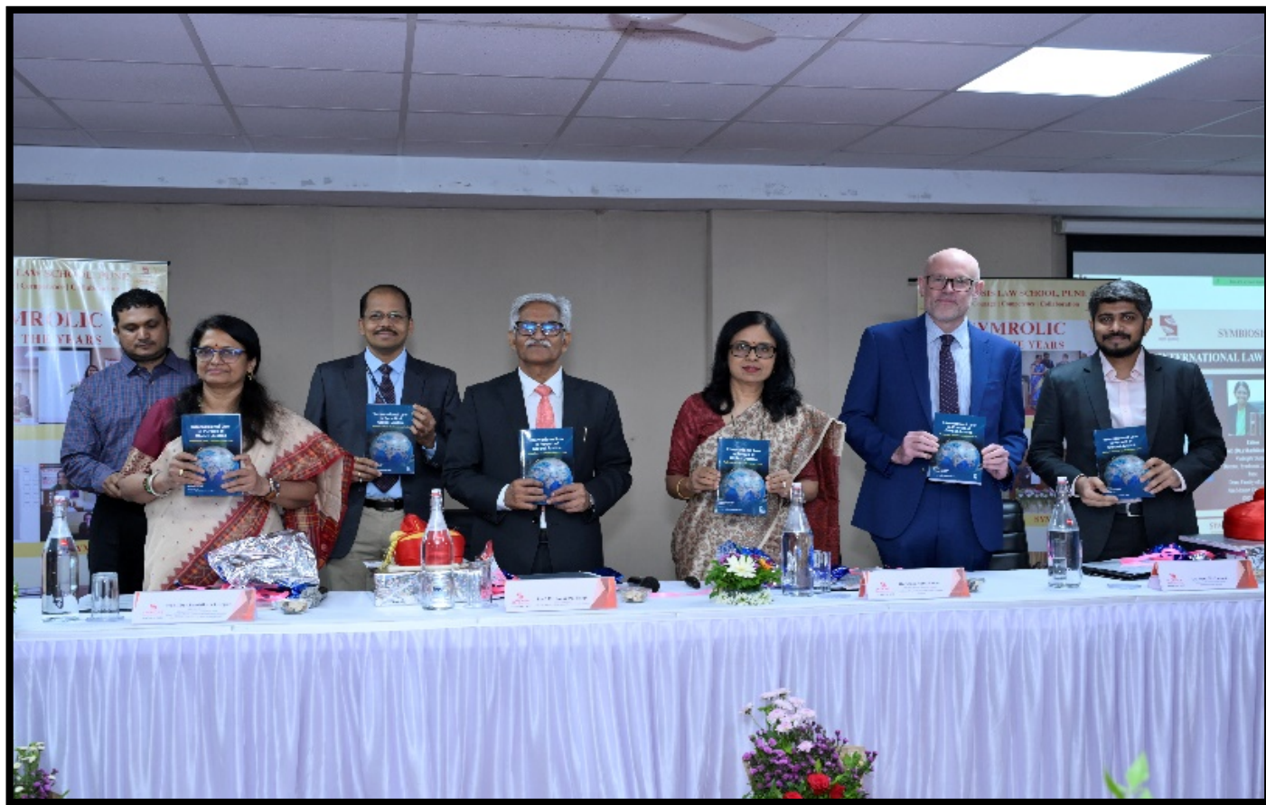
13th Annual International Research Conference - "Rule of Law in Context: Just World Order, Digital Life, AI, and Emerging Technologies." (SYMROLIC 2025)

Symbiosis Law School, Pune, a constituent of Symbiosis International (Deemed University), hosted SYMROLIC 2025 in association with SLS, Hyderabad, SLS, Nagpur, and SLS, Noida in hybrid mode on 25th and 26th April, 2025.