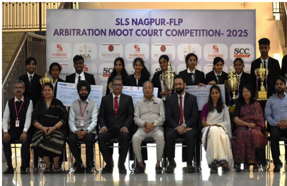
National Arbitration Moot Court Competition 2025, SLS, Nagpur