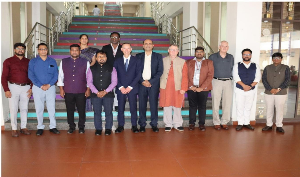
Guest Visit for Training and Placement Cell, SLSH on 25th June 2025