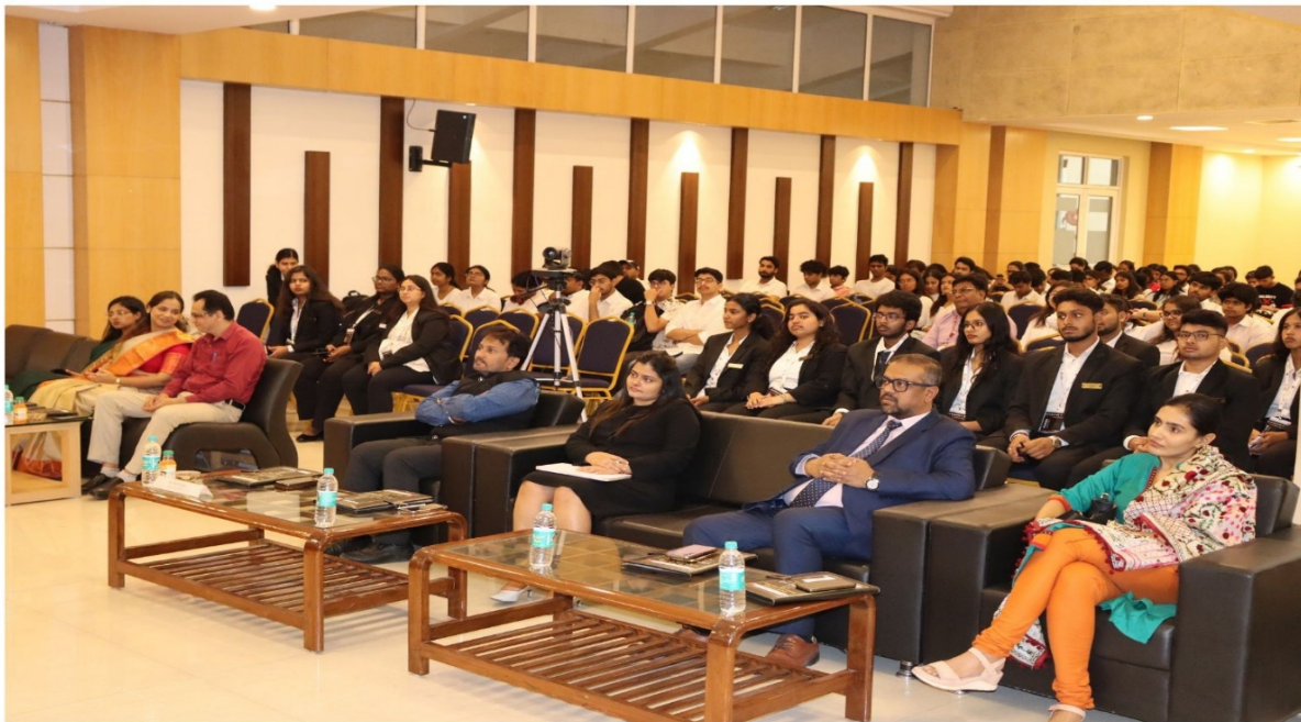
CRAT - Censitio 1.0 event conducted at SLSH on 28th March 2025