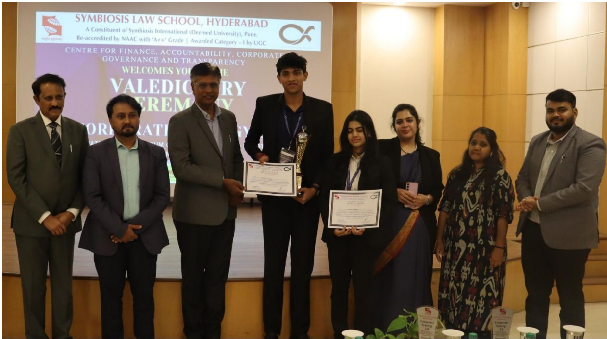
"Corporate Synergy", International Bidding Cum Contract Drafting and Negotiation Competition