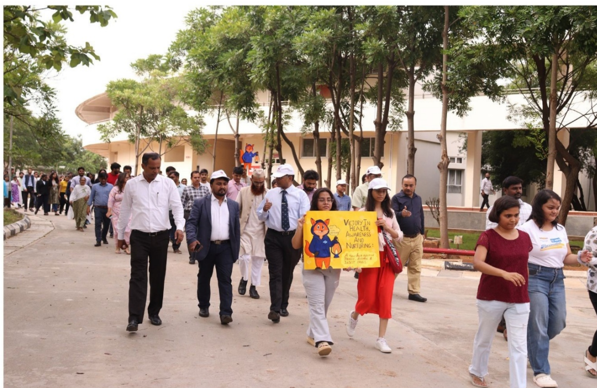
Walkathon held at Symbiosis Hyderabad Campus on 9th July 2025