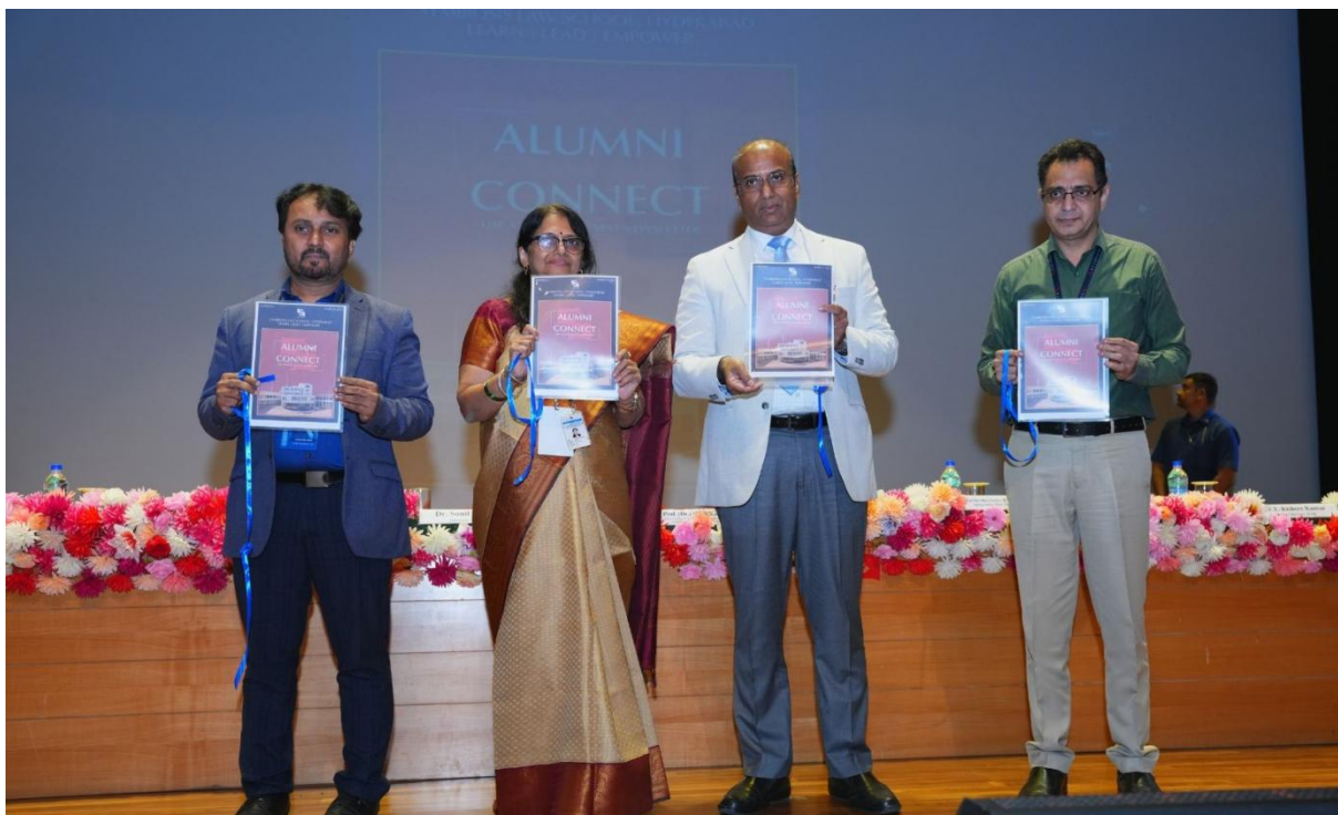
The First Alumni Meet of SLS Hyderabad – SYMCONNECT 1.0