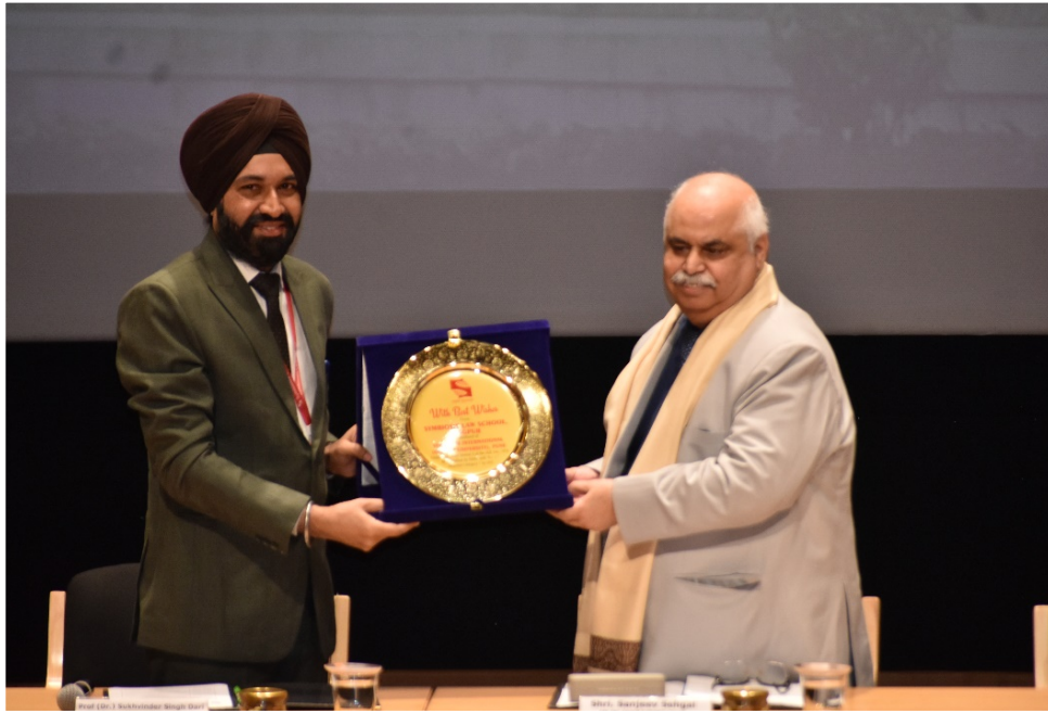
Additional Advocate General and Standing Counsel Government of India (Supreme Court of India). Oath Taking Ceremony at SLS, Nagpur