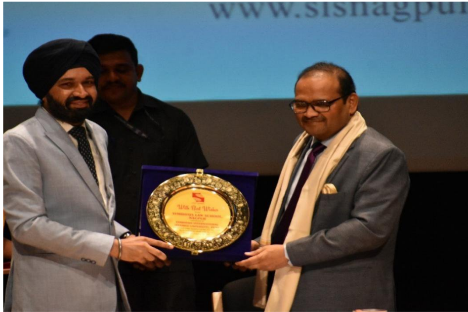
Felicitation of Hon'ble Shri Justice Jitendra Kumar Maheshwari Hon. Judge, Supreme Court of India LLB & LLM Induction Program at SLS, Nagpur