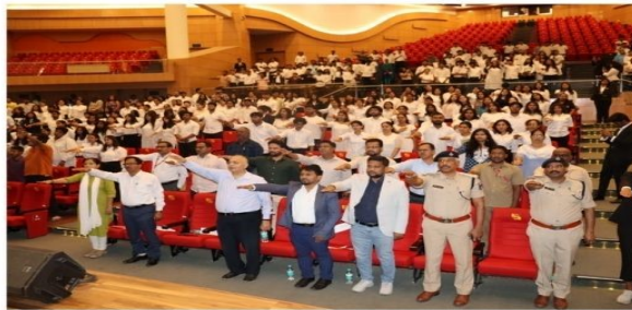
“Avagahana” – Anti-Drug Awareness Session in Collaboration with Telangana Anti Narcotics Bureau