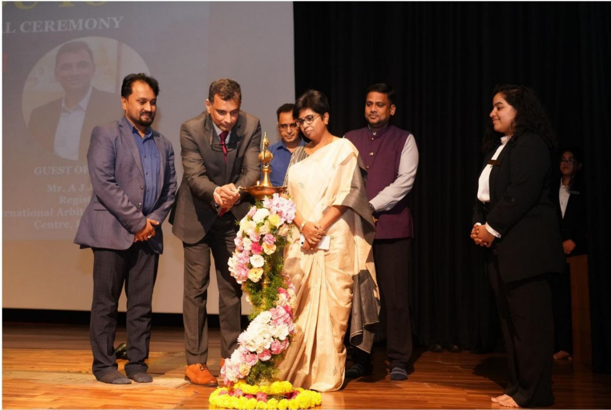
Deeksharambh for UG and PG programme held at SLSH on 1st July 2025